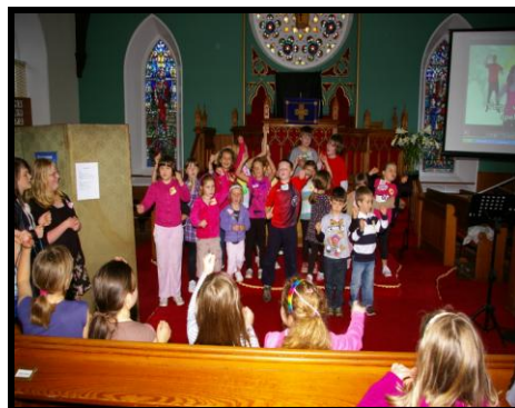
Photographs of the Holiday Club