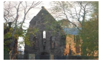
The Old Priory ruins

Beauly is well served with a good range of shops, generally privately owned with two small supermarkets, two major banks, a world famous tweed shop and a hardware shop. These are complimented by butcher, baker, chemist, post office, newsagents, ladies dress shop, delicatessen, hairdressers, beautician's, antique shop, cafes and gift shops.