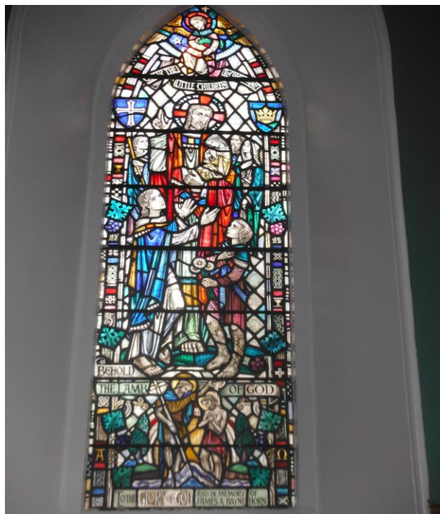
one of the Stained-glass windows in Beauly Church

Our website address is: http://www.beaulychurch.org.uk/