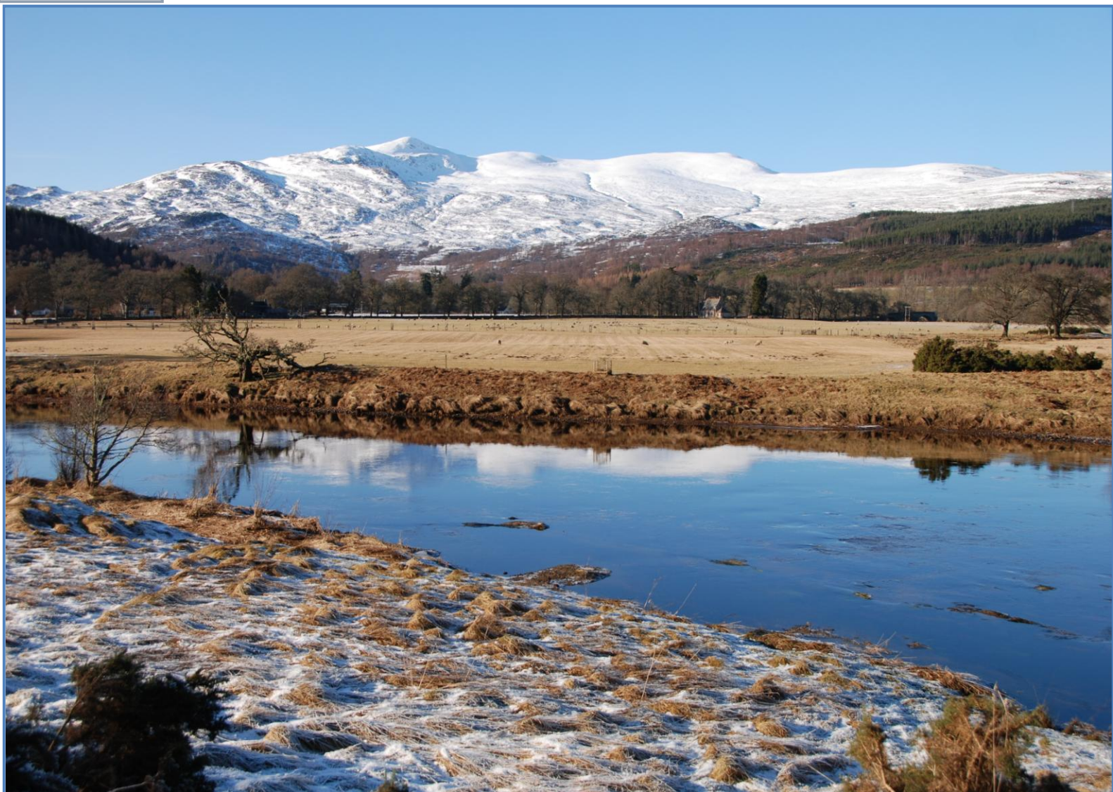
photograph: looking across the river to Struy Church