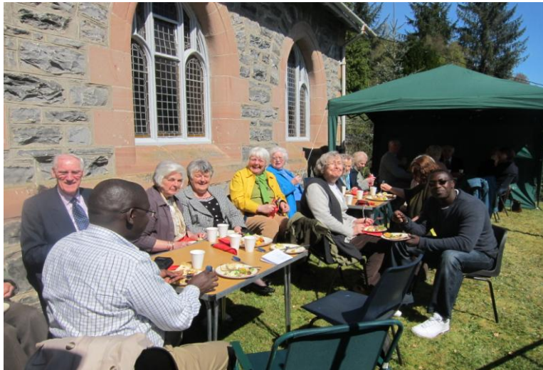
combined service picnic at Cannich